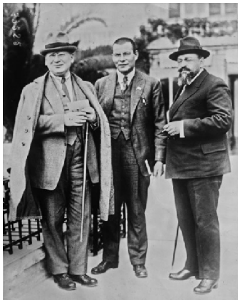
Alcune immagini d'epoca della Conferenza di Genova del 1922