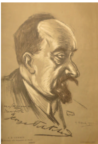
Ritratti dei delegati disegnati dal vero da Musacchio